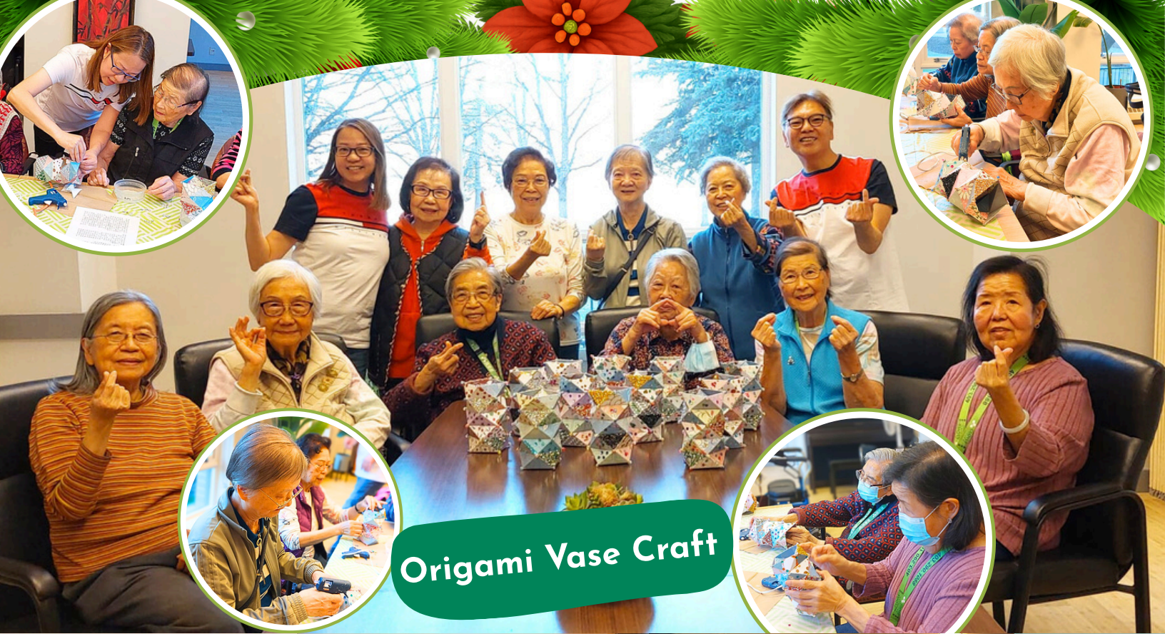
Origami Vase Craft